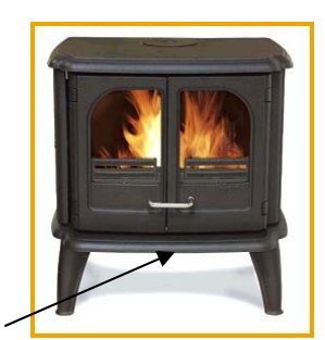
Air Vent Lever